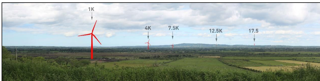
Figure 1-1 The effect of distance on visibility of wind turbines (Illustrative Purposes Only)